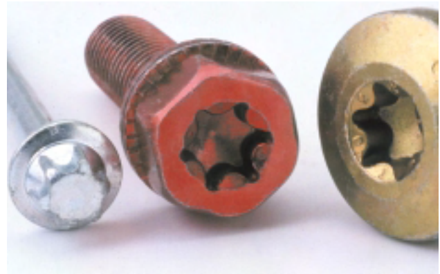
The TORX name appears on authentic products sized T15 and larger for easy identification.