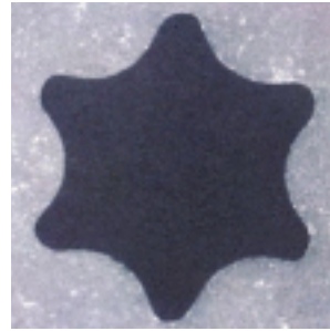
Authentic TORX Drive Bit

The authentic TORX fasteners and drivers themselves are manufactured to very critical, proprietary tolerances, with gaging that is available only to licensed TORX Drive manufacturers.