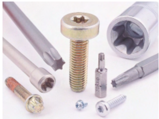
Authentic TORX fasteners and drivers are manufactured to very critical tolerances.